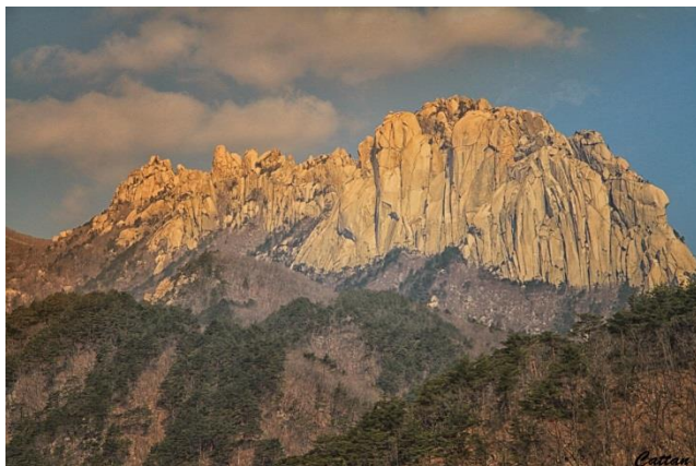
Mountain Seoraksan National Park

After breakfast, move to Gangneung (Approx 50min), visit Jumunjin Fish Market – you will see the vivid life of local people such as the fisherman bringing in their catch and retailers haggling over the fresh fish. Proceed to Yangyang