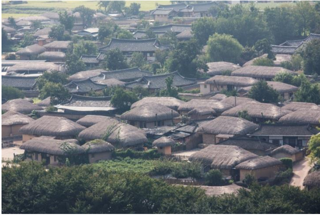
Hahoe Village, Andong, South Korea

After breakfast, move to Andong, visit Andong Hahoe Village (UNESCO World Heritage site) has become widely known as a must see place after Queen Elizabeth and George W. Bush’s visit. Proceed to Wonju (Approx 2 hour),