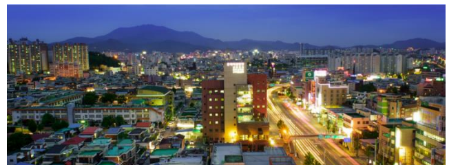
Gwangju, South Korea

Dinner: Vietnamese style Beef Shabu Shabu