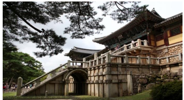
Bulguksa Temple, Gyeongju, South Korea

After breakfast, Move to Ulsan (Approx 1 hour 30min) visit Daewangam Park - there are huge boulders of rock formations. Then proceed to Gyeongju (Approx 45 min) which is the capital city of Silla for 1000 years. It is also called the museum without walls that many national treasures are preserved in here. After lunch, visit Bulguksa Temple (UNESCO World Heritage site) – is the axis of Silla