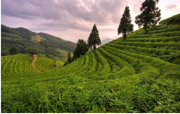
Boseong Green Tea Plantation, Boseong, South Korea

After breakfast, move to Boseong (Approx 1 hour 10 min), Visit Boseong Green Tea Plantation. You will see the tea bushes blanket and the landscape like a soft green carpet